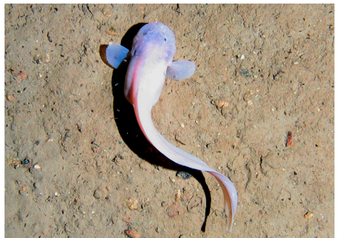
Fig. 1. The hadal snailfish N. kermadecensis (25). The image shows the snailfish alive at 7,199 m, photographed by baited camera close to the site where the samples were retrieved in this study (8). N. kermadecensis is endemic to the Kermadec Trench off New Zealand and occupies a very narrow depth band of 6,472 (24) to 7,561 m (8). The samples recovered for this study represent the second time this fish has ever been captured (the first time in 59 y) and represents the second deepest fish ever seen alive (7).

Tissue Integrity. Dorsal white muscle samples of the hadal snailfish were analyzed in several ways. We first tested for changes that might have occurred during the fish trap's 3 h 11 min ascent by analyzing water, sodium, potassium, and trimethylamine (TMA) contents. The muscles had a mean water content of 84.8 \pm 1.1\% (wt/wt), very similar to those in bathyal and abyssal species from 2,000–3,000 m (26). Sodium and potassium contents were 199 \pm 19 and 48.2 \pm 5.1 mmol/kg, respectively, differing considerably from seawater, which at 35 ppt has sodium and